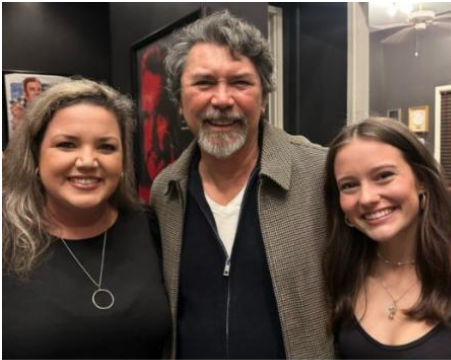
Lou Diamond Phillips La Bamba, Longmire, Young Guns