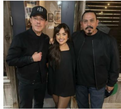
Theo Rossi & Emilo Rivera Sons of Anarchy