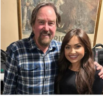
Richard Karn Home Improvement